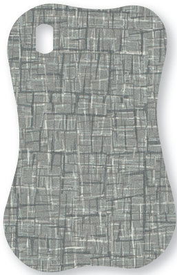
AG1000 T Gray Kinetic