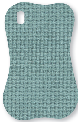
AB2400 T Aqua Mini Raffia