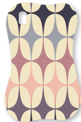
DG0077 SD Odenton Pink Lady