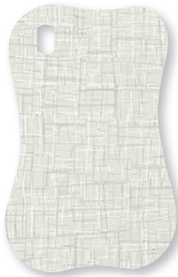
AW1800 T White Kinetic