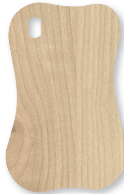
WM2640 T Planetree Maple