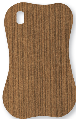
WY2000 T Miesian