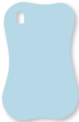
S3069 T Soft Island Breeze