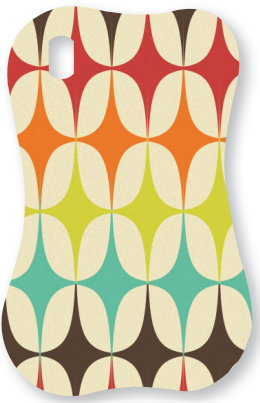
DG0078 SD Odenton Neon Lights