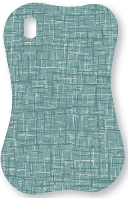
AB4440 T Turquoise Kinetic