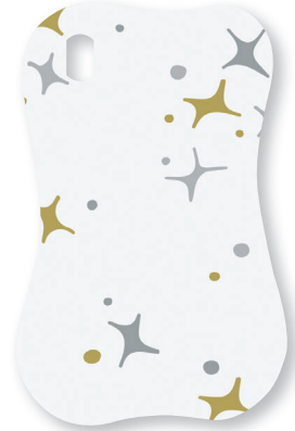
DG0071 SD White Venus 2