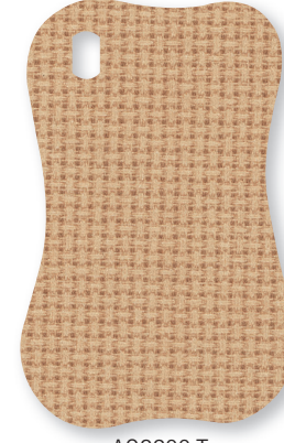
A03200 T Tangerine Mini Raffia