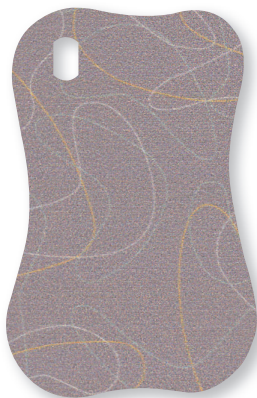
DG0075 SD Lilac Boomerang