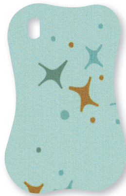
DG0072 SD Turquoise Venus 2