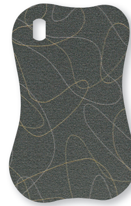
DG0076 T Carbon Black Boomerang