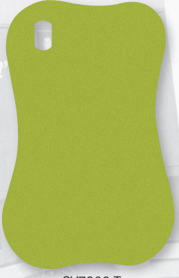
SV7300 T Pear Green

NEVAMAR carefree KITCHENS ARE 100% LIFETIME SURFACED with jewel-hard plastic laminate outside and inside all doors, drawers and shelves Nevarmar Carefree Kitchens spill and nick-proof need shelf-paper waxing. Wipe cloth. Long cabinets need Nevarmar Carefree still look like Choose warm soft pastels. Find dealer in Yellow mate on Deluxe or priced Custom Line sample of Nevarmar plastic lam- inate in latest fashion tone, Teak- wood-write Nevarmar Carefree Kitchens, Odenton, Md.