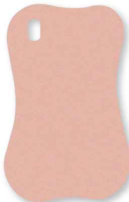
SR5100 T Blushing Pink