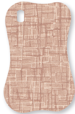
AR2830 T Pink Lemonade Kinetic