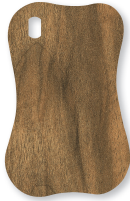
WW9600 T Mid-Mod Walnut