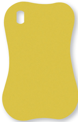
SY9250 T Marigold Fields