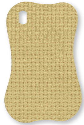
AY1500 T Gold Mini Raffia

Nevamar is proud to celebrate its 80th year in style by introducing the Yesteryears™ Collection, a mix of 20 new and retro inspired designs. These rich woodgrains, abstracts and solids are inspired by some of our favorite patterns over the past 80 years.